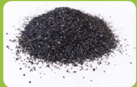
Figure 2. Biochar