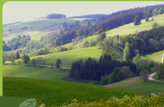
Figure 3: Forest trees and agriculture crops →

They also encompass residues and wastes, such as those from plantation and agriculture operations, wastes from construction and wood processing industries, as well as household wood waste.