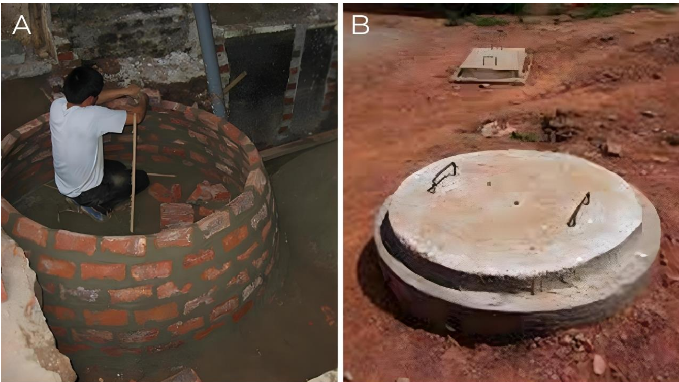
Figure 3: Fixed-dome small-scale biogas plant (© SuSanA Secretariat (2009), used under Creative Commons Attribution-NonCommercial-ShareAlike 2.0 Generic). A) Construction of fixed-dome biogas plant near Hanoi © SuSanA Secretariat (2009), used under Creative Commons Attribution-NonCommercial-ShareAlike 2.0 Generic. B) Top manhole of biogas digester © SuSanA Secretariat (2011), used under Creative Commons Attribution-NonCommercial-ShareAlike 2.0 Generic.

To support Ethiopia's current efforts and fill the existing research gaps in examining small-scale biogas plants according to the Sustainable Development Goals (SDGs), a finely tuned, detailed new study is proposed as a Ph.D. dissertation and implementation is in progress. The study aims to identify and review the constraints and challenges that hinder the dissemination of small-scale biogas plants in Ethiopia to recommend a solution in the context of the SDGs and the circular economy. Furthermore, it will investigate the contribution of small-scale biogas plants to individual sustainable development goals and will assess the productivity of existing small-scale biogas plants in comparison to regulatory requirements, safety regulations, and standard production averages in line with the SDGs. It is expected to be completed by June 2026.