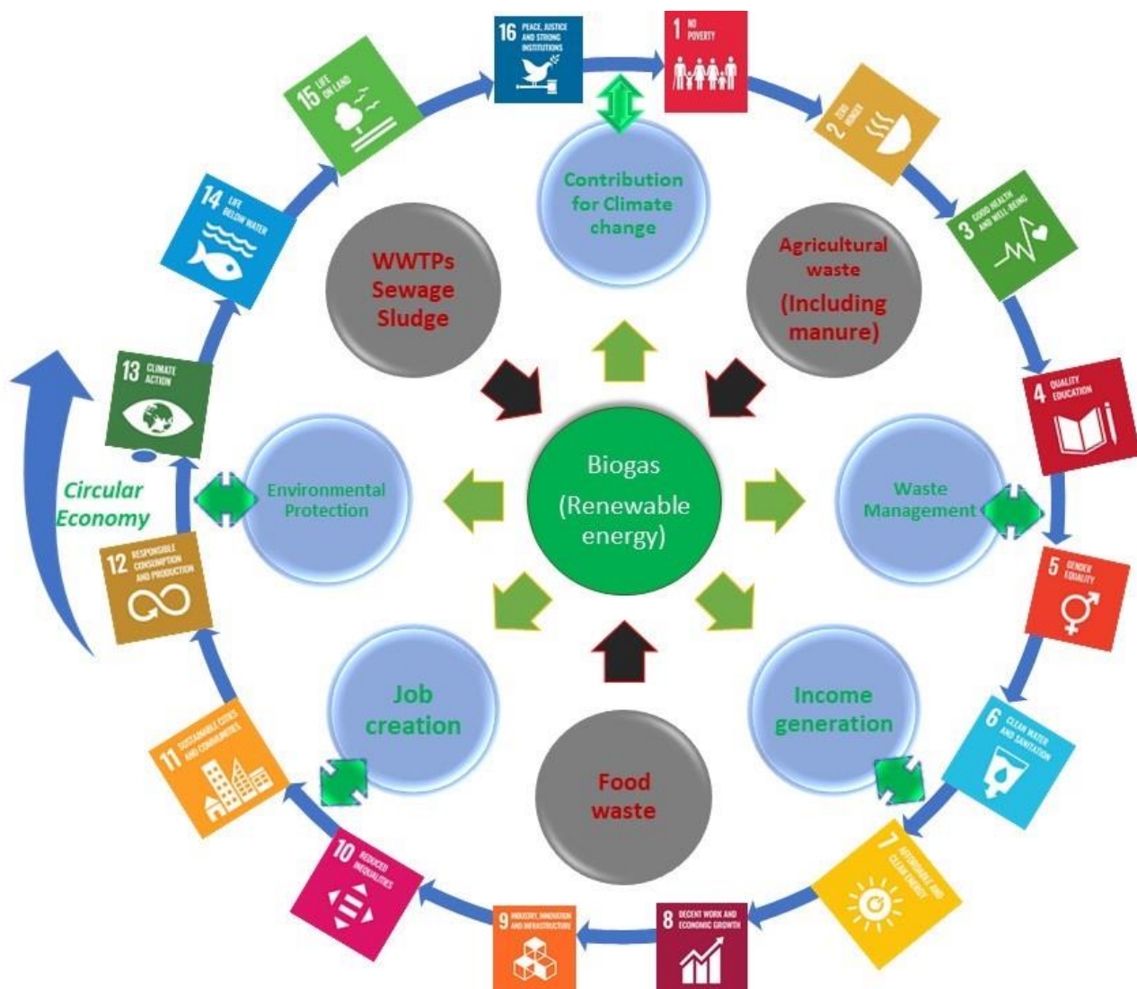
Figure 2: Interactional Framework of biogas with SDGs and circular economy.

In Ethiopia, the technology was introduced to the country around 1957 at Ambo Agricultural College (Kamp & Bermúdez Forn, 2016). Then, with many ups and downs through times and governmental approaches, it is still in its infancy. The most implemented biogas plant in the country is a small-scale digester with a size of 6 m 3 . In this category, as shown in Figure 3, a fixed dome digester is dominant, followed by a floating drum digester. The country implemented the national biogas programme in 2009 with the support of SNV. Through the implementation of this program, the number of small-scale biodigesters reached 22,166 in 2018 (United Nations Environment Programme, 2019). When this number is compared to the size of the country, population growth, the gap between available energy and existing needs, and the potential of the nation to produce biogas, it is insignificant. In addressing this limitation, different studies were conducted to answer country-specific questions and further accelerate the dissemination and expansion of technology.